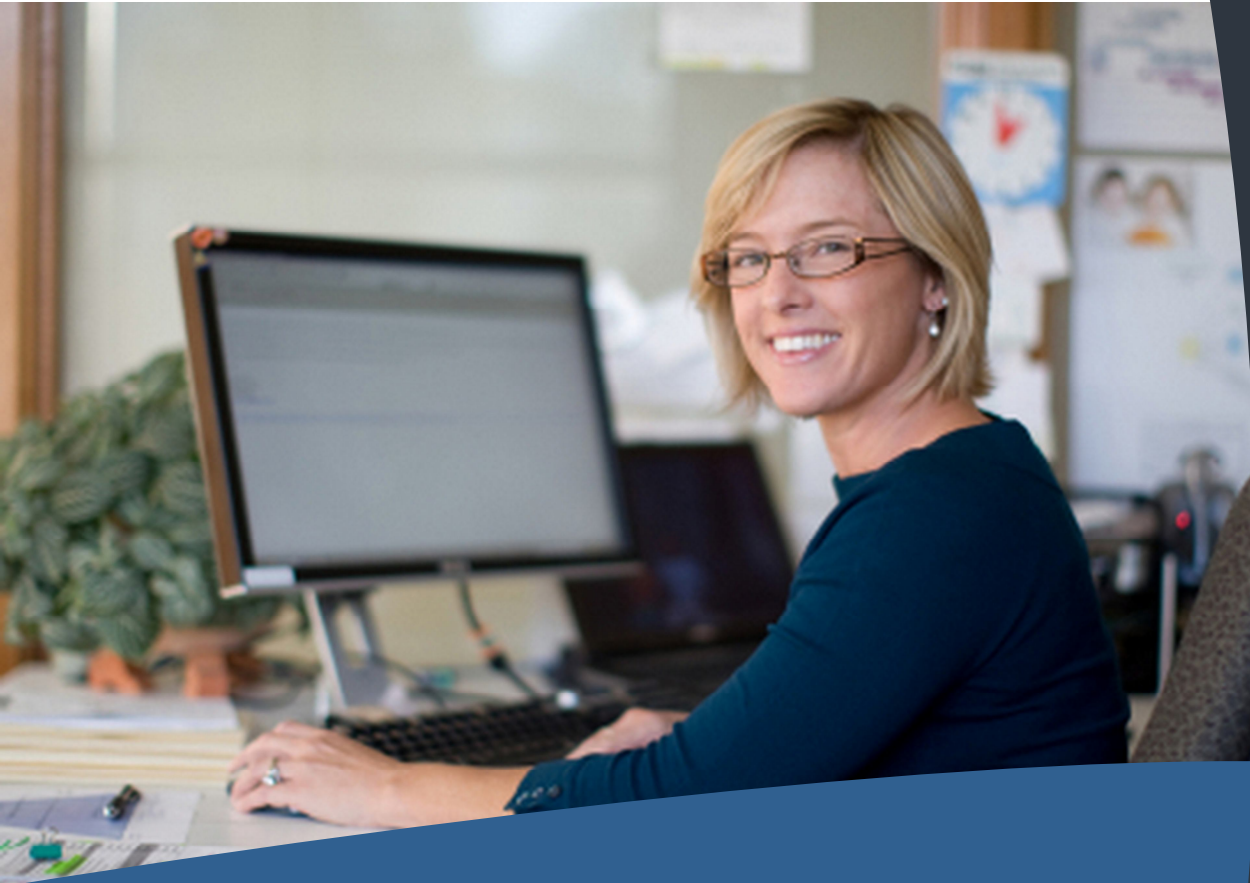
Chart Audit Solutions